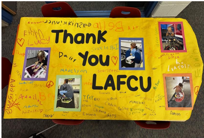
Ellis Elementary students and staff created a thank-you banner for LAFCU to celebrate receiving the LAFCU Innovation for Education (LIFE) Grant. The banner features photos of the new tools in action and signatures from students and staff, reflecting the school’s appreciation for the resources that are helping students learn and thrive.

With the funds, the school has added 24 flexible seating arrangements across its 19 classrooms, purchased 30 sensory tiles, and even created “sensory paths” within hallways to help students regulate their emotions when they need a moment to reset. Students from four classrooms, kindergarten through second grade, participated in a celebration showcasing the new tools and spaces that are already making a difference in daily learning.