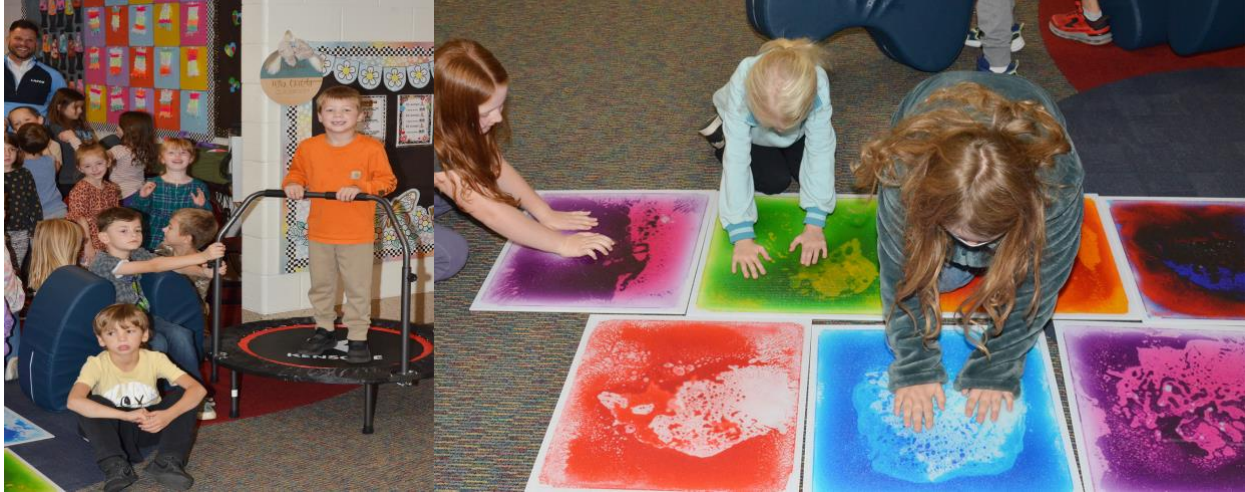
Trampolines purchased through the LAFCU Innovation for Education (LIFE) Grant provide Ellis Elementary students with a healthy way to regulate their emotions and regain focus, supporting the school’s efforts to promote movement and mindfulness in learning.