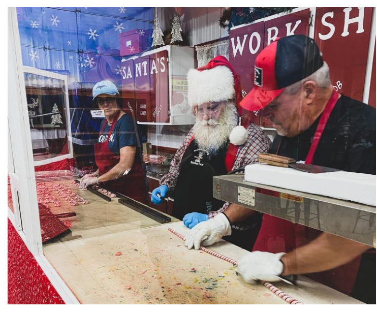
The Dec. 7 Christmas Special features a visit to Santa's workshop to learnhow candy cane is made.

social media channels and on its website the day of the event.