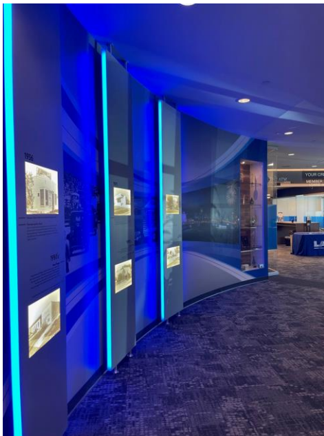
LAFCU staff collaborated with Visual Entities to create a visual history of LAFCU that spans more than eight decades of providing financial services and technology solutions to communities throughout mid-Michigan. The history wall features photos and detailed descriptions of the credit union’s history.