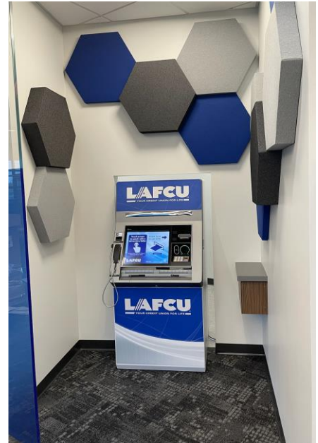
One of the four ATM/ITM machines located in LAFCU’s newly renovated lobby that offers members virtual face-to-face banking.

The result is a space that is both modern and timeless, complete with four ATM/ITM machines that enable virtual face-to-face banking, in-person member service representatives and a wall commemorating LAFCU’s history since its founding in 1936. Visual Entities, headquartered in Wyoming, Michigan, created the history wall, which includes photos and detailed captions that pay tribute to LAFCU’s eight-decade history.